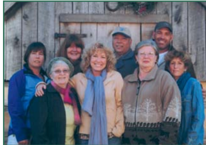
Valley Craft Network Members

Homegrown products of sustainable agriculture from our sheep and dairy farm.